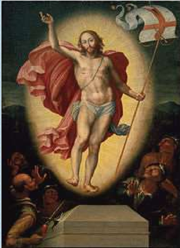
Easter Season March 31 - May 19