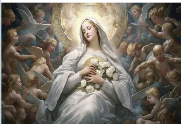
Common of the Blessed Virgin Mary Saturdays during Easter